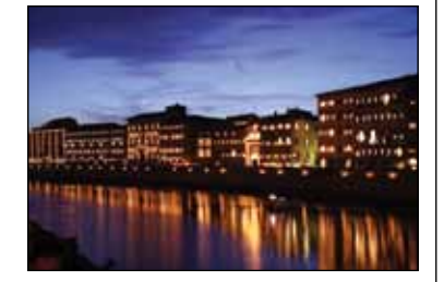
Don't miss Pisa's 2010 Luminara June 16